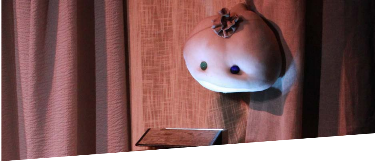
Illustration : Théâtre des Petites Âmes